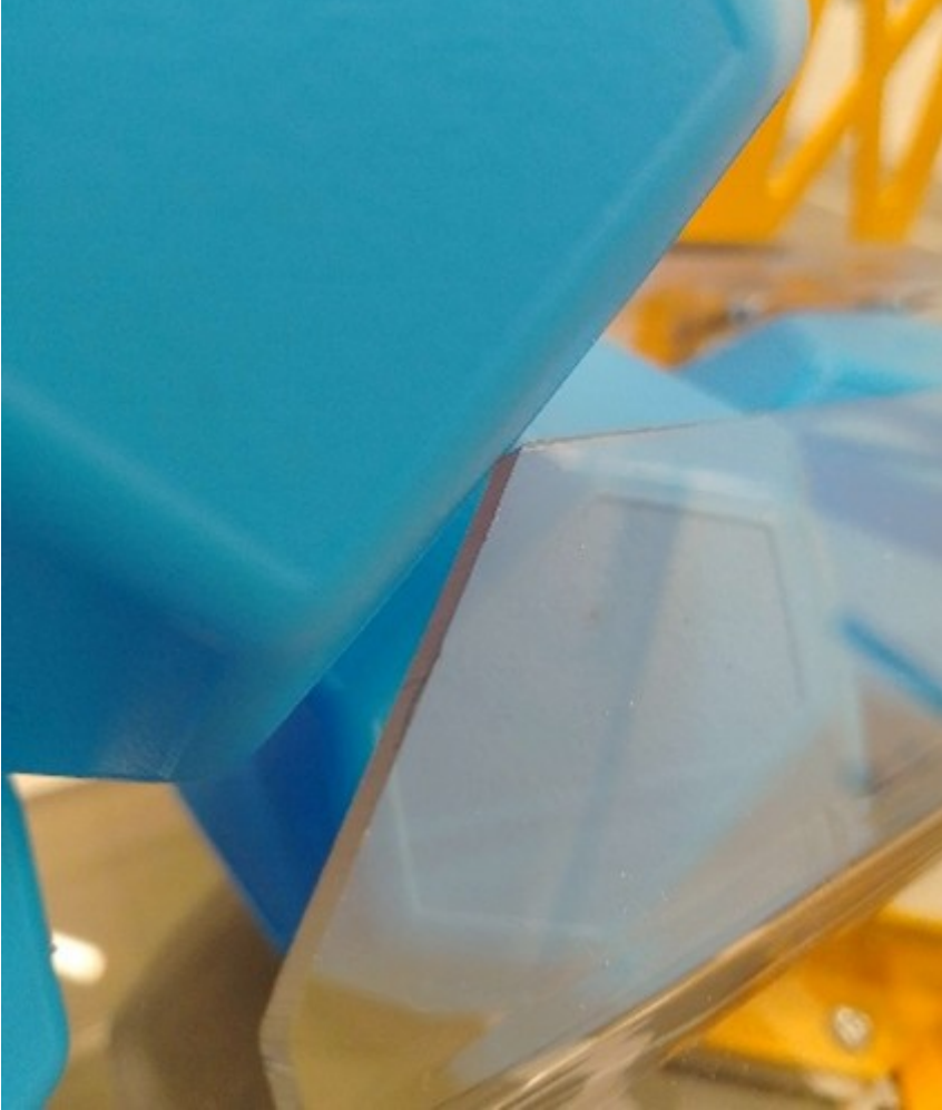
(Left: image of Blocks Scored in Center Lower

Goal, right: close up of Block contacting only an inside corner of the plastic trough)